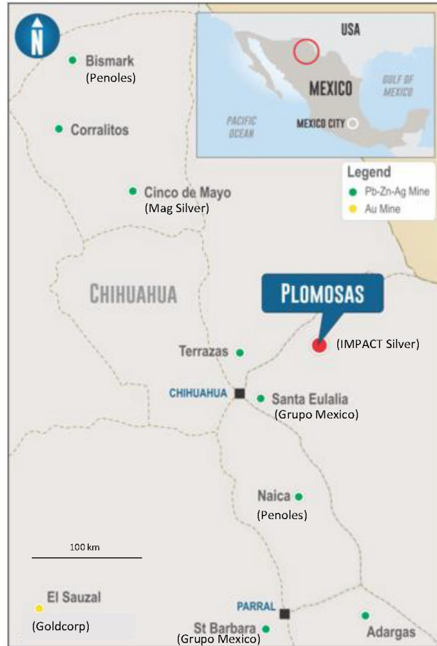
Figure 1: Location map of Plomosas Mine and nearby mines and infrastructure. References to nearby projects are for information purposes only and there are no assurances that Plomosas will achieve similar results.